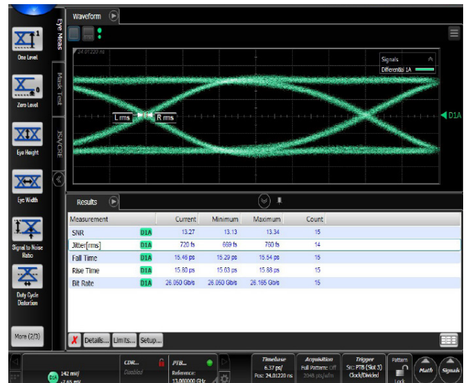
Example of 26 Gbps PRBS data signal generated using the low noise internal clock synthesizer.