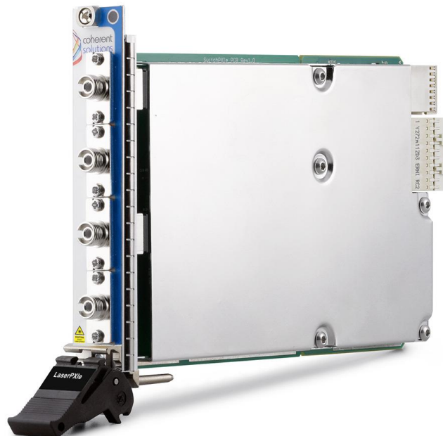
Coherent Solutions LaserPXle module

Low linewidth lasers are important for use in systems such as coherent communications, fiber optic sensors, interferometric sensing and gas detection. Typically, linewidths vary greatly depending on the type of laser; they can be as large as tens of nanometers for powerful broadband dye lasers down to as low as a few Hz for lasers employing ultra-stable reference cavities.